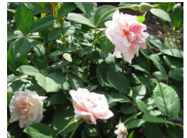
Cecile Brunner Rose